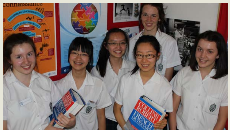
Alliance Française Examination high achievers.