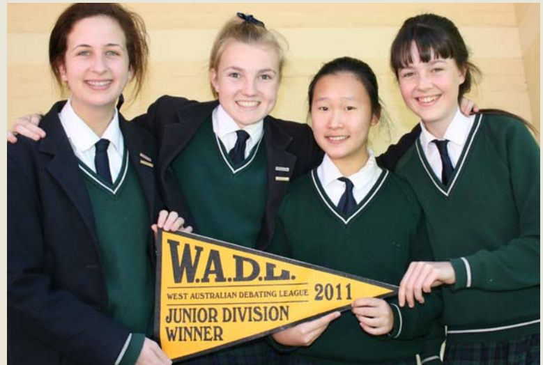
WADL Debating Competition winners.