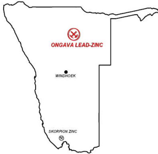
Fig 1: Location of Ongava Project in Namibia